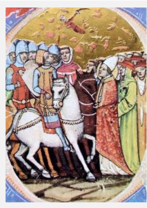
St. Leo meets Attila the Hun

Why practice virtue at all? What is the point of choosing daily to train and discipline our desires? Are we merely aiming to become “better people” or “self-disciplined” – a vague spiritual fitness regimen?