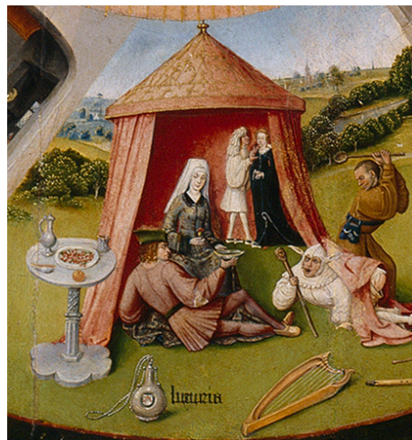
“Lust,” from The Seven Deadly Sins and Four Last Things , Hieronymus Bosch, ca. 1500.

The presumed qualities of each sex are still being used to define what