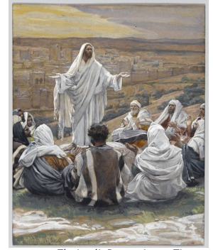
The Lord's Prayer - James Tissot

Why should we have a strong prayer life? The Gospel of Mark 9:2-10 gives us the first answer: Jesus took three disciples and went up a mountain to pray. We want to pray because Jesus is calling us to be with him: we want to because He wants us to.