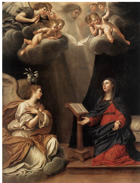
The Annunciation, Francesco Albani

Come Holy Spirit, inflame our hearts in the same yearnings for redemption as the Heart of Christ, so that we truly offer our persons and works, in union with Him for the redemption of the world.